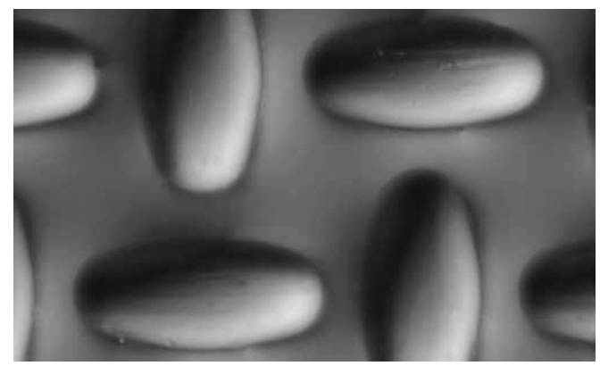
SEFAR® PA after 5.000 prints

SEFAR® PA has excellent abrasion resistance and is therefore suitable for applications that require the use of highly abrasive inks; for example screen printing on tiles.