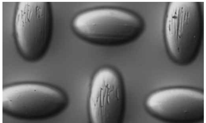
Standard polyester mesh 120/305-34W after 5.000 prints