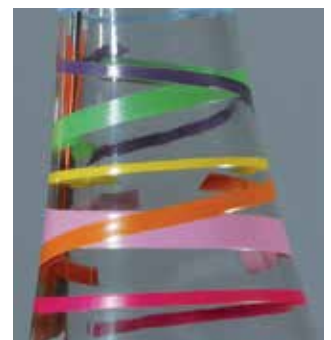
High density and sharp contours with SEFAR® PA 100/255-38Y