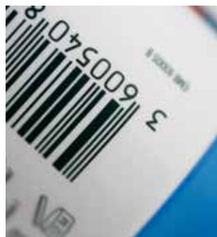
High density sharp edged bar codes printed with SEFAR® PA 140/355-30Y