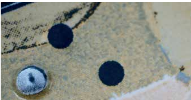
Structured and highly resistant floor tiles with SEFAR® PA 61/155-60W

SEFAR® PA is suitable for applications that require the use of highly abrasive colors and wherever the stencil has to fit to shaped substrates: For example, printing on tiles, plastic or glass containers.