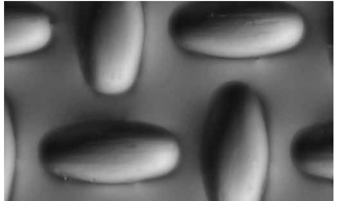
SEFAR® PA 120/305-35W after 5.000 prints

SEFAR® PA properties leave no wish unanswered: High elasticity; excellent abrasion resistance; very good adhesion of the stencil material and – in yellow – unsurpassed UV-A light undercutting protection.