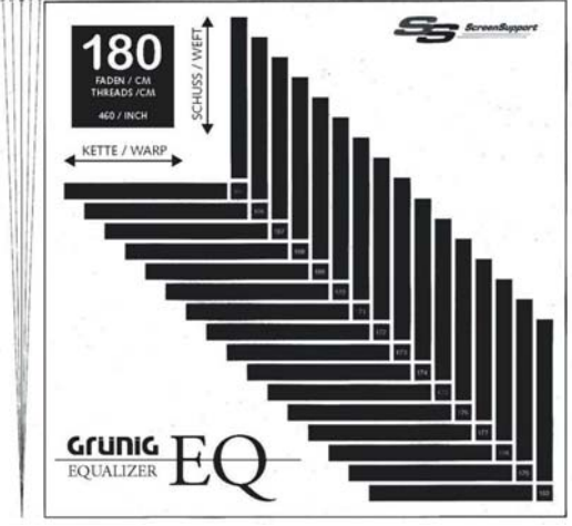
Test film EQ 180