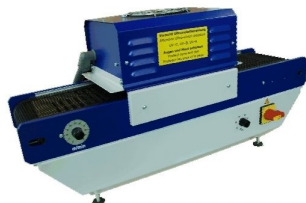
Laboratory systems available