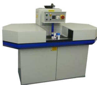
UV systems to dry 360 dregrees available