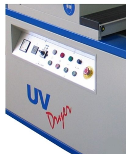
Option to have electronic lamp power adjustment from lamp to achieved optimal results