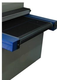
Belt made in Teflon mesh anti-static