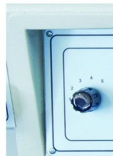
Multi strokes program available as standard