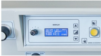
LCD display with several informations such us: speed, timers, working mode, etc..