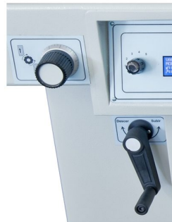
Printing table can be adjust in height up to 20 mm by using a handle