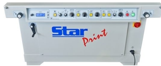
Machine controlled by PLC with up/down; print/flood made by