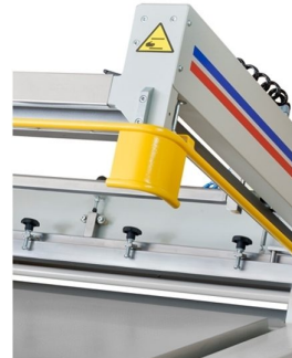
Emergency security bar with automatic reverse from descending to ensure operators safety in all machine area